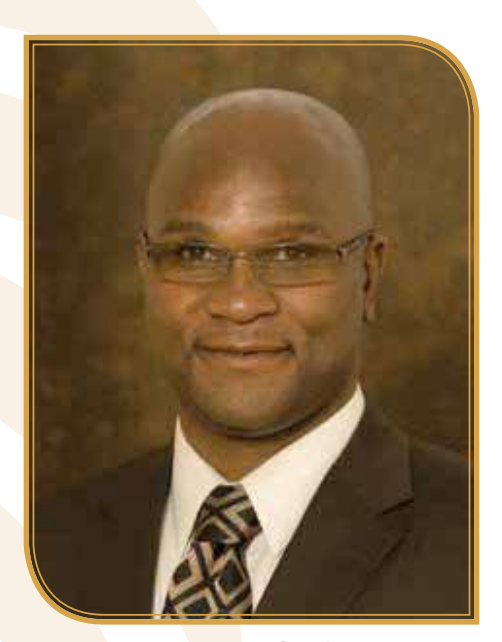
Minister of Police Mr EN Mthethwa, MP

The Private Security Industry Regulatory Authority (PSiRA) was established in 2002, in terms of Section 2 of the Private Security Industry Regulation Act 56 of 2001.