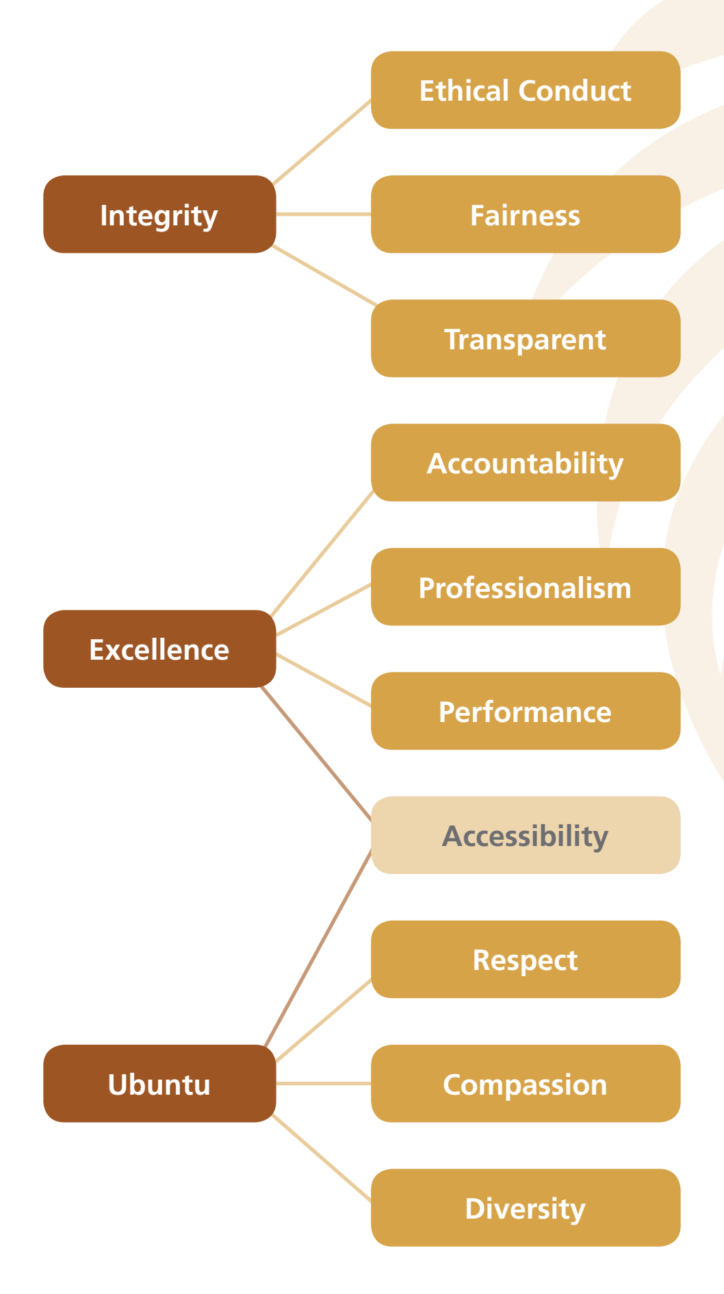
Figure 1: Values Framework for PSiRA